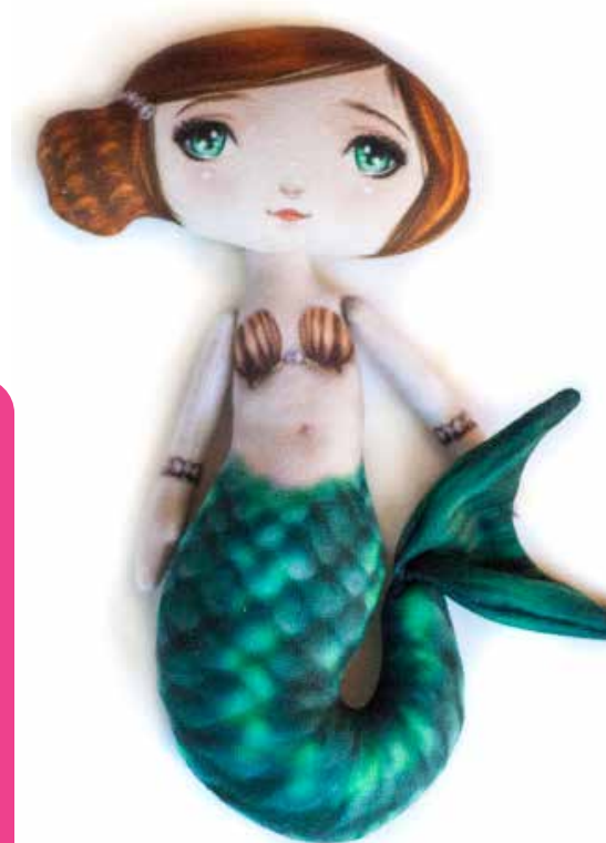
IMAGE 15 Example with External Arms

Why not put a rattle or bell inside while stuffing, or a crystal or other magical things? Or use some bean pellets for extra weight in the hands or tail? Embellish the outside of your doll with lace, buttons, glitter paint or make the doll a beautiful pearl necklace or sea shell crown.